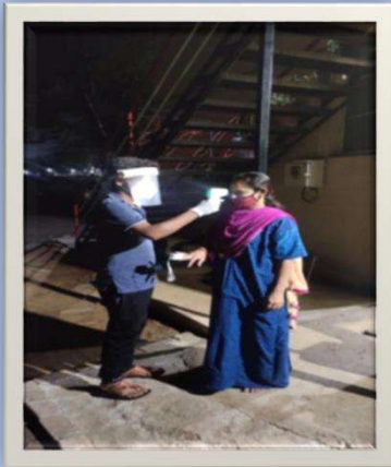
Assistance offered to Health Department, NMC Nashik