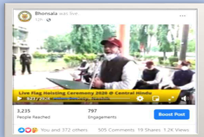
Facebook Live: Flag hoisting on Independence Day