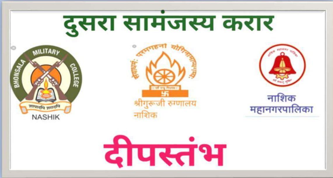
DEEPSTAMBHA FOR COVID 19 COUNSELING CENTER