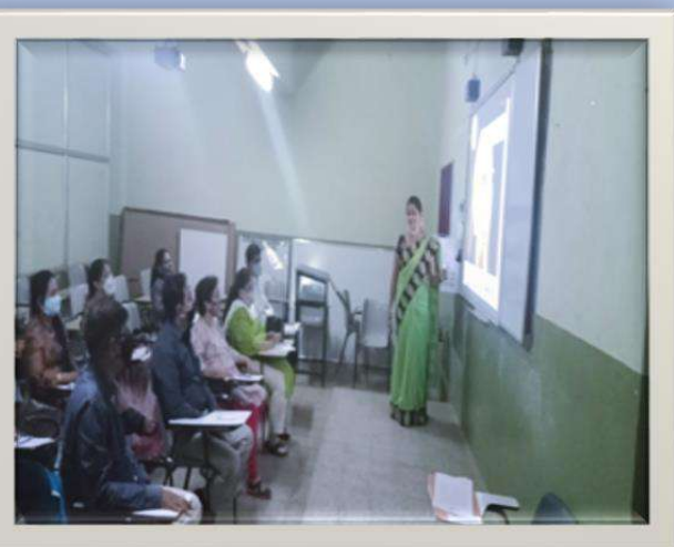
Smart Board Training to the Teaching Staff