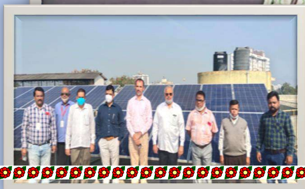
Solar Committee Visit (SPPU)