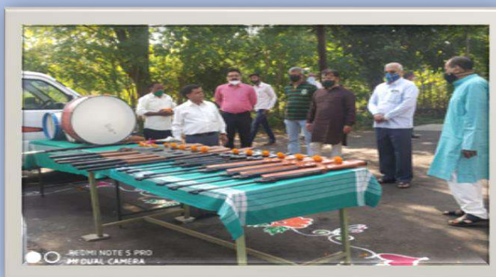
Shastra Poojan on occasion of Dassera