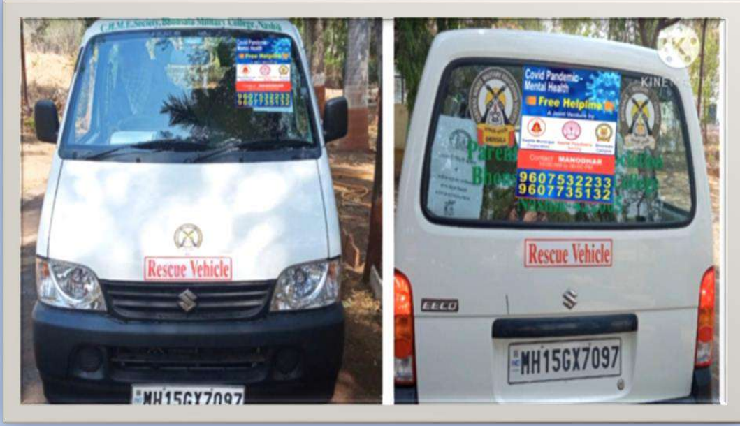
Manodhar Counseling Center established in Collaboration with Nashik Municipal Corporation, Nashik Psychiatric Association and B.M.College