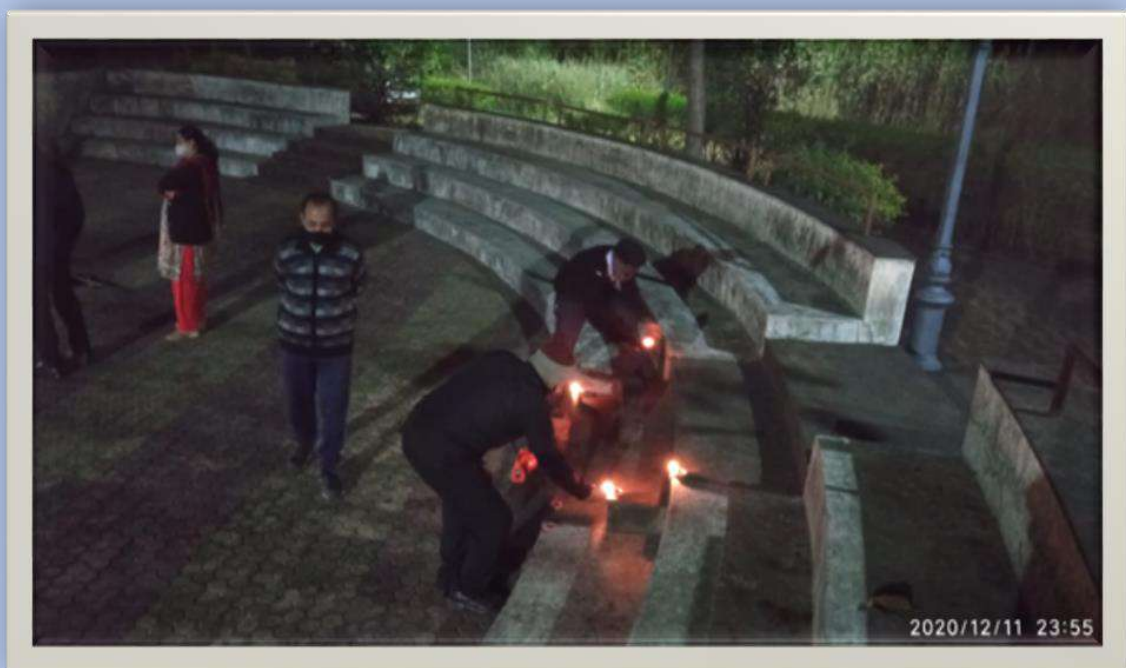
Moonje Day being observed by lighting 148 diyas