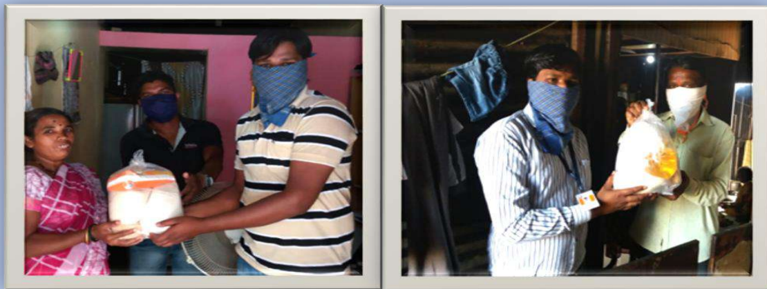
Grocery distribution to the needy in Kabir Nagar during Pandemic