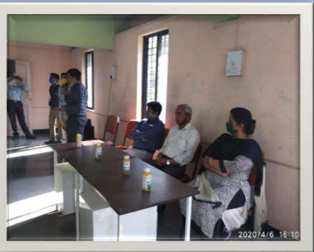
Extending Psychological Support and Counseling Migrant workers during Pandemic