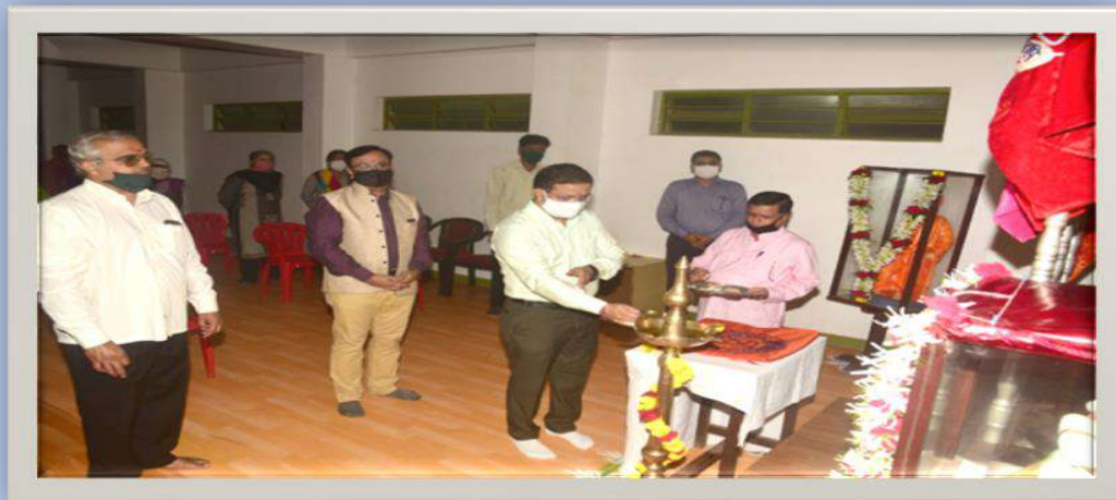
College Foundation Day Celebration