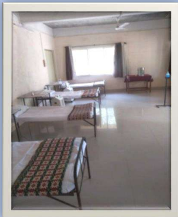
Isolation Center with Ventilator established in College