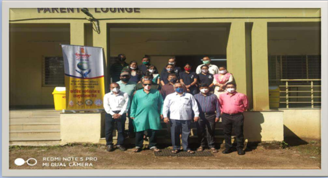
Deepstambha, Counseling Unit in Collaboration with Gurji Rugnalay, NMC and B M. College