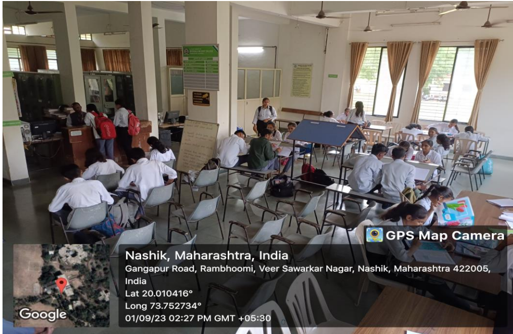
Library and Reading Hall